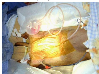
Figure 2: Modified open peritoneal drainage system using Jackson-Pratt drain