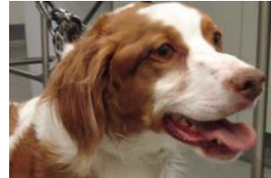
Figure 1. Lady Bug

Signalment: Lady Bug is a 4 year old, female spayed, Brittany spaniel.