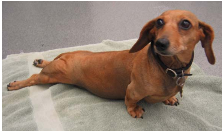
Figure 1. Hind limb rigidity and hypertrophy in a dog with hyperadrenocorticism.

On physical exam, she had generalized patchy alopecia and a moderately distended abdomen. Her skin was thin with ventral hyperpigmentation. She was ambulatory, but had bilateral pelvic limb extensor rigidity with prominent hind limb and paraspinal muscular development, atypical of dogs with hyperadrenocorticism. Conscious proprioception in the pelvic limbs was delayed, but present. She had no evidence of spinal pain, nor other neurologic abnormalities.